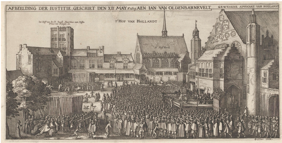
Fig. 7 Claes Jansz. Visscher, Execution of Johan van Oldenbarnevelt, 1619, etching, 18,6 x 36,5 cm, Amsterdam, Rijksmuseum.