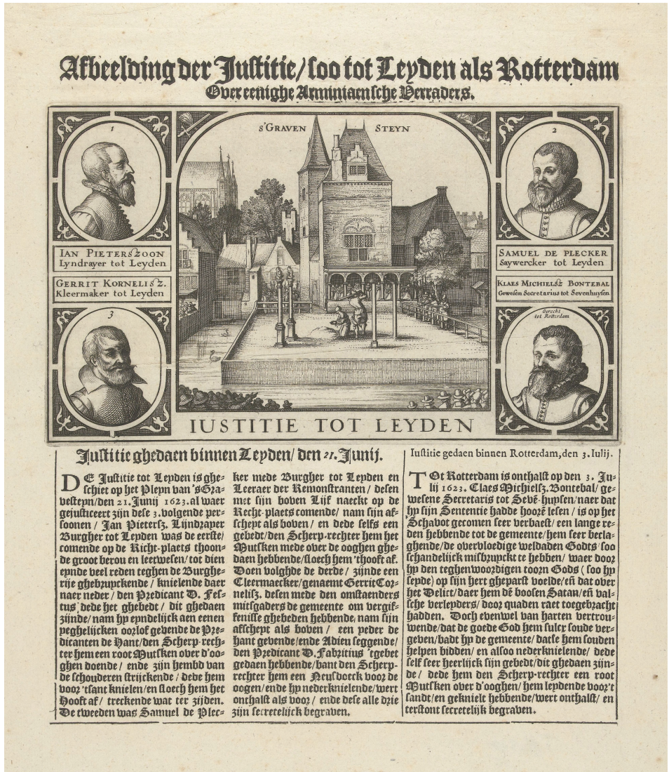
Fig. 19 Claes Jansz. Visscher, Executions of 'Arminians' in Leiden and Rotterdam, 1623, etching and letterpress, 37,4 x 29,1 cm, Amsterdam, Rijksmuseum.

acknowledges the works had been published before, but explains that as individual news-prints they could not defame the criminals and their Remonstrant allies in perpetuity: