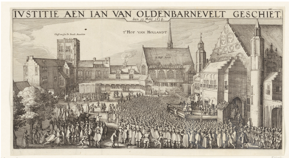
Fig. 8 Claes Jansz. Visscher, Execution of Johan van Oldenbarnevelt, 1619, etching, 20,2 x 37,1 cm, Amsterdam, Rijksmuseum.