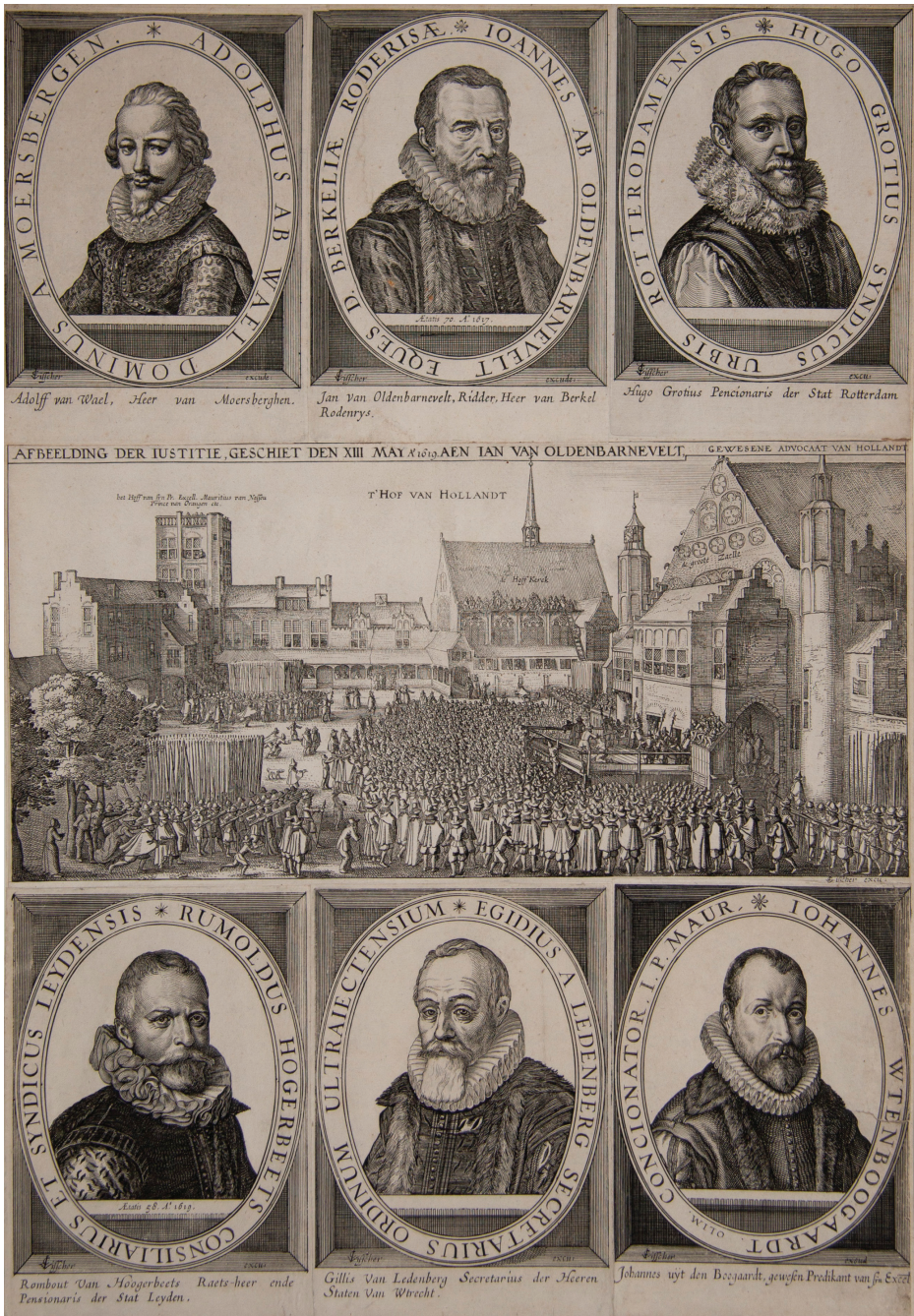
Fig. 10 Claes Jansz. Visscher, Execution of Oldenbarnevelt on 13 May 1619, 1619, etching and engraving, 53 x 37 cm, Champaign, Krannert Art Museum.