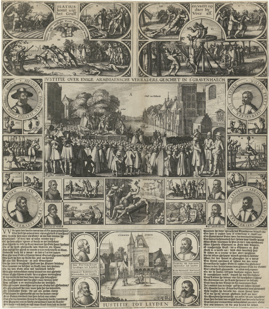
Fig. 1 Claes Jansz. Visscher, Executions of the Conspirators against Prince Maurice, 1623, etching and letterpress, 54,2 x 47 cm, Amsterdam, Rijksmuseum.

which were generally preserved in print collections or libraries. While no surviving sources attest to who purchased these monumental prints of contemporary executions, it stands to reason that displaying printed images of judicial death and dismemberment in one's home – where family, friends, and acquaintances might see them – would have been an avowal of political and confessional loyalties, the justness of the courts, and good government in the Dutch Republic more broadly. In that regard, hanging execution newspapers on the wall communicated specific and enduring political and religious worldviews.