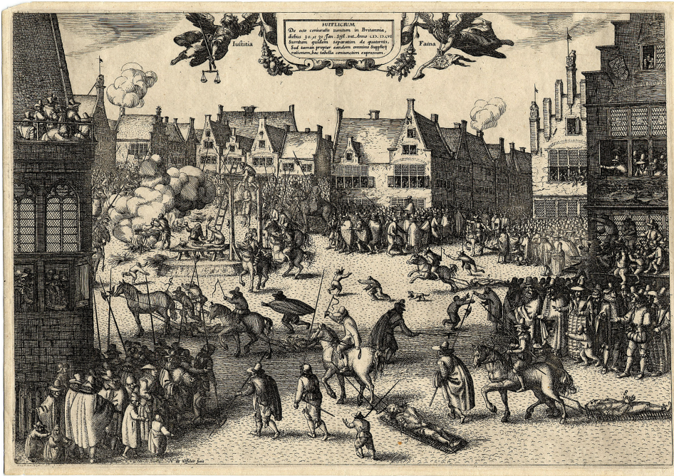
Fig. 3 Claes Jansz. Visscher, Execution of Eight Gunpowder Plot Conspirators in England, 1606, etching, 23,4 x 33,8 cm, London, British Museum.