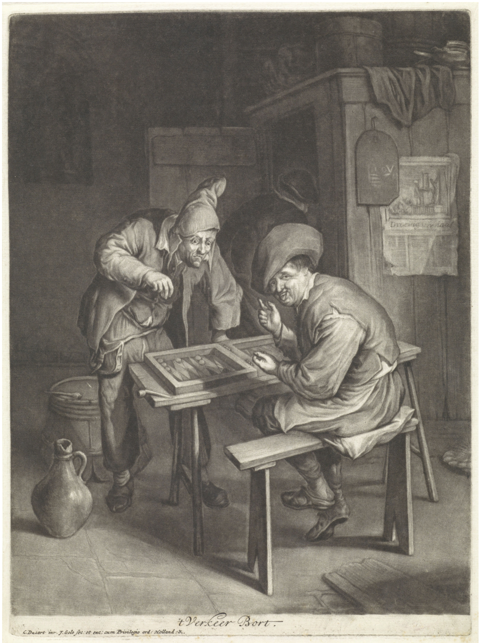
Fig. 15 Jacob Gole after Cornelis Dusart, Tric-trac Players, c. 1670-1724, mezzotint and engraving, 24,7 x 18, cm, Amsterdam, Rijksmuseum.