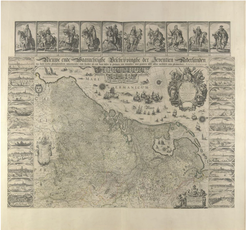
Fig. 13 Claes Jansz. Visscher, Nieuwe ende Waarachtighe Beschrijvinghe der Zeventien Nederlanden , Klencke Atlas , c. 1660 (first edition William Jansz. Blaeu 1608), engraving, 176 x 231 cm, London, British Library.

of his other mezzotints. 59 Either way, a broadside such as this – with a sensational tale of wrongdoing and comeuppance – would be right at home in a place of entertainment and socialization like a tavern.