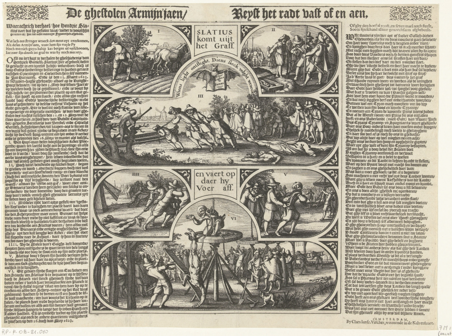
Fig. 18 Claes Jansz. Visscher, Hendrick Slatius Goes Back from Whence He Came, 1623, etching and letterpress, 27 x 23,2 cm, Amsterdam, Rijksmuseum.

This was not to be their final resting place. A farmer ploughing his field accidentally uncovered them five days later and summoned the authorities. Visscher portrayed the gruesome antics that ensued in a newsprint entitled 'Slatius comes out of the grave, and goes [whence] he departed' (fig. 18). 67 We see the farmer discovering the remains, which Visscher unsympathetically calls 'crow-bait'. When the executioner and his servant arrived to retrieve them, the corpses were too heavy for them to drag by themselves and bystanders refused to help. This was a job for dishonourable men; direct contact with executioners and executed criminals carried a terrible stigma. 68 In the end, the executioner had to rely on 'a few unsuitable boys' for help. 69