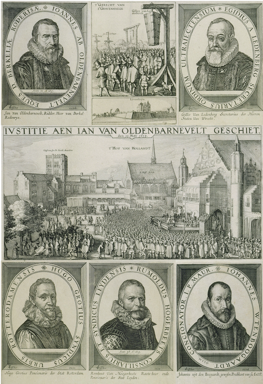
Fig. 11 Claes Jansz. Visscher, Execution of Oldenbarnevelt on 13 May 1619, 1619, etching and engraving, c. 53 x 37 cm, reproduced in an exhibition on view in 2015 at Loevestein Castle, private collection.