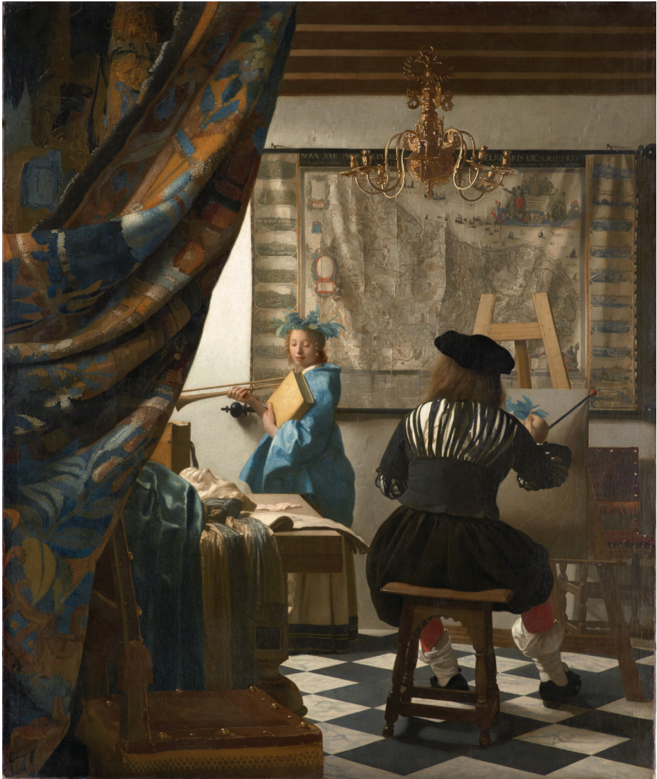
Fig. 14 Johannes Vermeer, The Art of Painting , c. 1666-1668, oil on canvas, 120 x 100 cm, Vienna, Kunsthistorisches Museum Wien .

must have known Protestants would be interested. And not only those in the Republic, who might read the Dutch letterpress, but also elite buyers abroad for whom there were captions in Latin. Visscher's 1619 execution prints also had broad appeal. Certainly, Oldenbarnevelt's enemies would have been enticed. That includes Counter-Remonstrants, proponents of the establishment of the West India Company, and the pro-war faction,