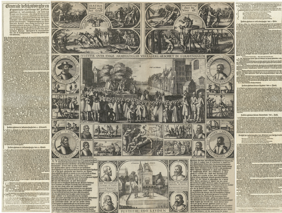
Fig. 2 Claes Jansz. Visscher, Reconstruction of Executions of the Conspirators against Prince Maurice, 1623, etching and letterpress, 54,2 x 102,5 cm, Amsterdam, Rijksmuseum.