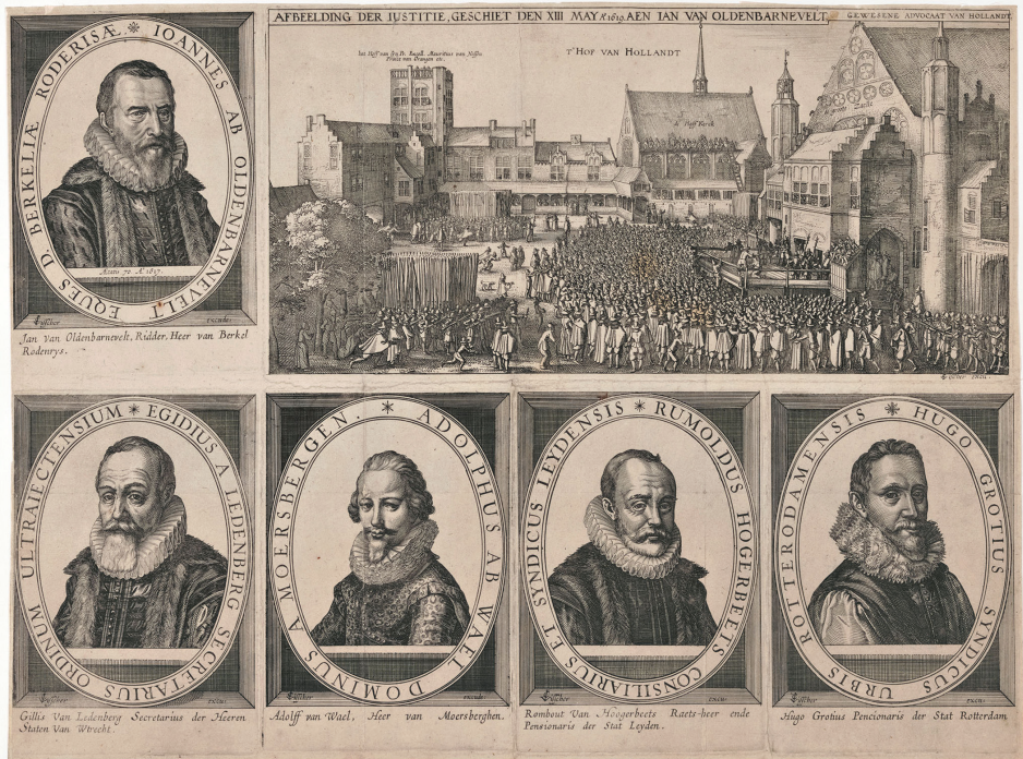
Fig. 9 Claes Jansz. Visscher, Execution of Oldenbarnevelt on 13 May 1619, 1619, etching and engraving, 36,7 x 49,5 cm, Dordrecht, Huis van Gijn.

inward. The layout has a pleasing logic and flow. Oldenbarnevelt is in the privileged position at top left, turned in the direction of his beheading. Wtenbogaert is opposite: the leader of the Remonstrants standing in for all those expelled from the Reformed Church for following Arminius. At bottom left, Grotius and Hogerbeets look right, toward their prison at bottom centre. On the other side, Ledenberg faces his ignoble end on the gibbet. Van der Wael finally joins his companions, taking the last spot. Many impressions of this print survive, some of them hand-coloured, testifying to Visscher's commercial success with this experiment. Together with Van Wouw's printed sentences, the ensemble print and print bundles disseminated an authoritative vision and rationale for these contentious events.