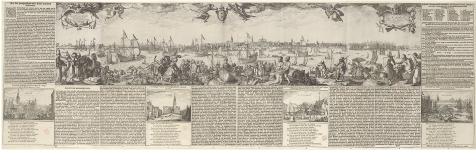
Fig. 6 Pieter Bast (printmaker), Claes Jansz. Visscher (printmaker/publisher), Hugo Allartz (publisher), View of Amsterdam , 1611, etching and letterpress, 62,8 cm x 171,7 cm, Amsterdam, Rijksmuseum.