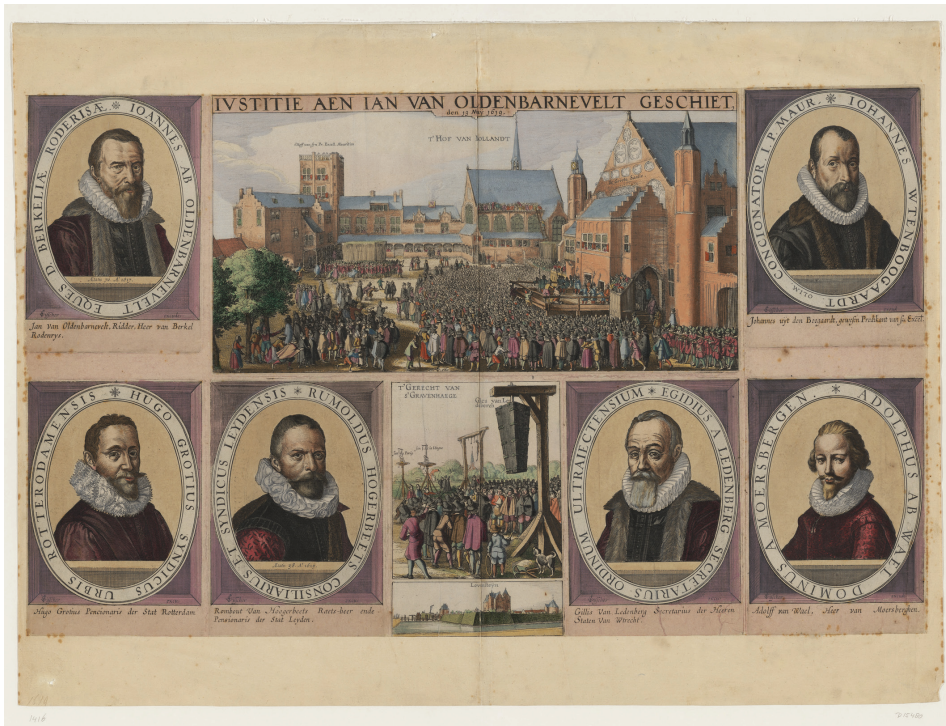
Fig. 12 Claes Jansz. Visscher, Execution of Oldenbarnevelt on 13 May 1619, 1619, hand-coloured etching and engraving, 46 x 6,4 cm, Rotterdam, Atlas van Stolk.

products of the Amsterdam map-making industry' because of their artistic ingenuity and the vast amount of knowledge they represent. 49 Unfortunately, the number and variety of wall maps that were produced is uncertain because their survival rate is exceptionally poor. Their scale and prolonged exposure to light, humidity, and grime made them much more vulnerable than atlas maps or other prints that were preserved in volumes or portfolios, and primary sources mention many that no longer survive. 50 More wall maps incorporated letterpress additions than did not, with customers choosing one or more texts in Germanic and Romance languages or Latin. 51 Decorative wall maps were incredibly popular among the moneyed classes in the Republic, adorning private homes and state rooms alike. They were especially appealing to Dutch families that participated in mercantile exchange, invested in the East and West India Companies, and those interested in scientific expeditions, colonial ventures, and warfare. Oldenbarnevelt himself displayed