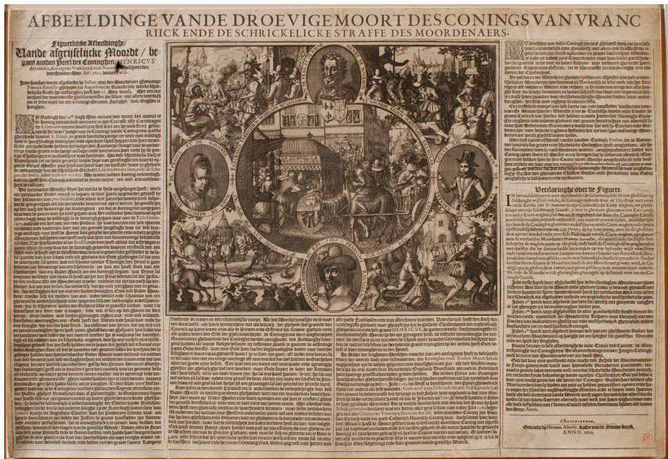
Fig. 5 Claes Jansz. Visscher (printmaker/publisher) and Herman Allertsz. (publisher), Murder of King Henry IV of France and the Execution of Francois Ravailac, 1610, etching, 26,7 x 33,2 cm (newsheet 43,4 cm x 63,7 cm), Chantilly, Musée Condé.

An exhausted horse had to be replaced partway through and even still the executioner had to resort to cutting away Ravailac’s limbs. What’s worse, some spectators took trophies from the corpse, some of them even cooking and eating the flesh. Mutilating and even consuming the bodies of traitors was a symbolic act of cleansing that helped the populace restore authority to their rightful leaders, but it did not exactly suggest orderly and measured justice. 19