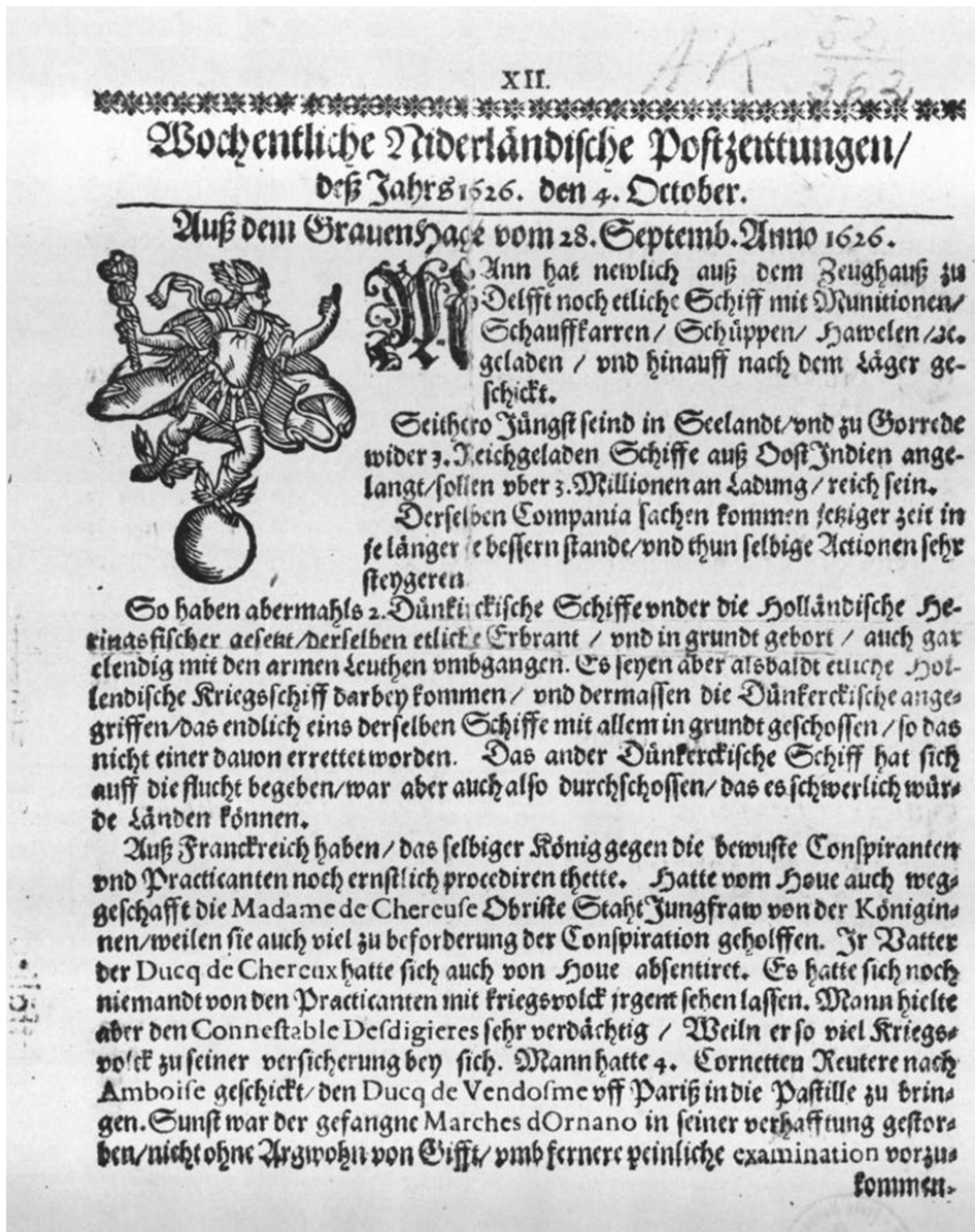
Fig. 2 Johann Mertzenich (ed.), XII. Wochentliche Niderländische Postzeitungen/ deß Jahrs 1626. den 4. October. Cologne 1626, Dresden, Saxon State Archives.

very business-minded printer, sensed that the demand for news allowed for the publication of a second newspaper. In August 1626, he was granted the privilege for this enterprise: the Wochentliche Niderländische Postzeitungen (fig. 2). As in the case of the Raporten , he