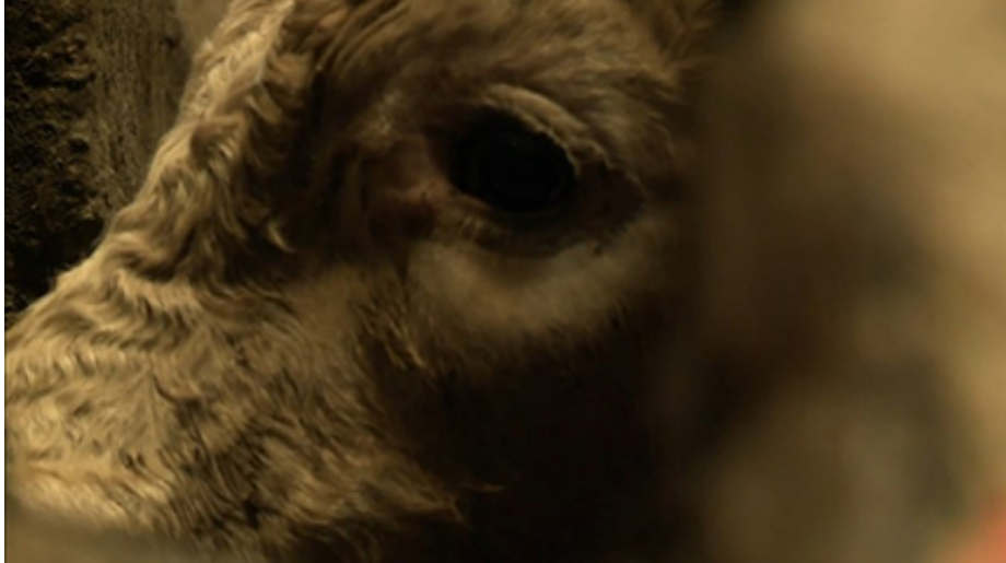
Figure 2 (00:42)

La Parka runs just over twenty-seven minutes until final credits, and Serra devotes all but four and a half of those minutes to depicting the slaughterhouse and the processing of cattle into sides of beef and by-products. The film begins with a quickly edited and