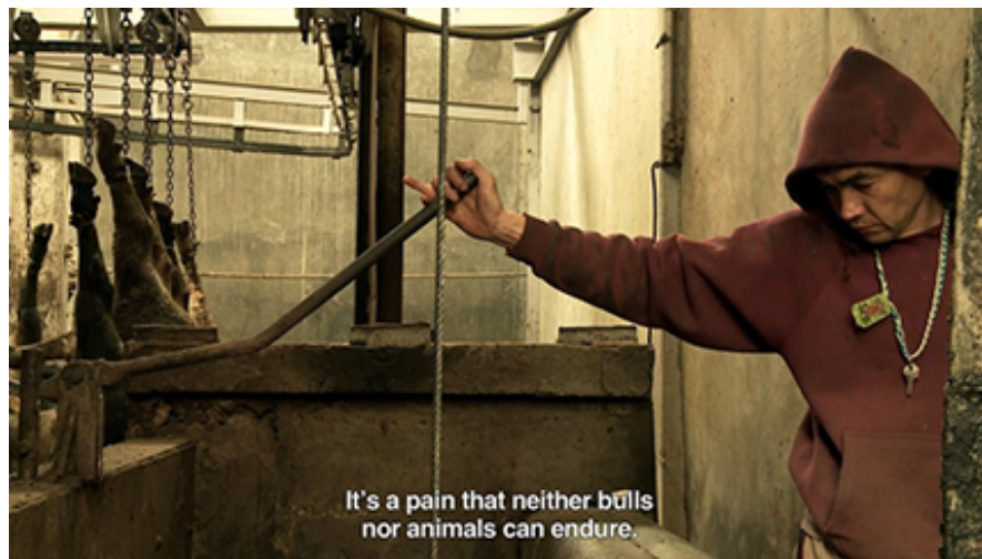
Figure 6 (15:47)

Although Jiménez García later asserts a moral distinction between killable animals and non-killable humans, his other comments cited here indicate that he, like other slaughterhouse workers, understands all too well that awareness of the animals' sentience and consciousness make it impossible to kill them without some degree of instinctive guilt or remorse.