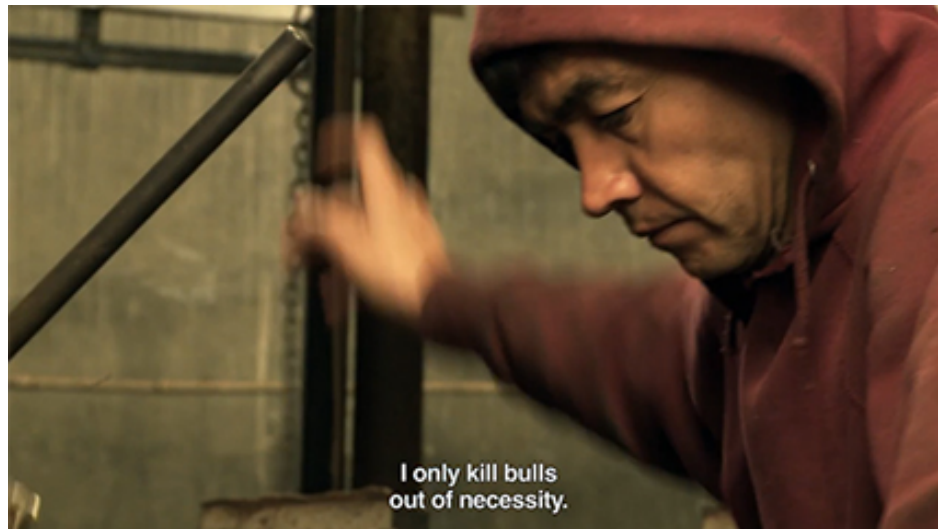
Figure 9 (26:15)