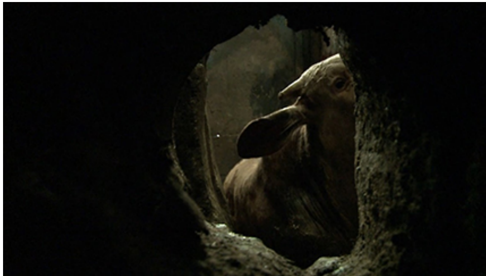
Figure 10 (26:50)

Ríos recalled that despite its eventual induction into the Argentinean film canon, Faena initially met with hostility and incomprehension as almost no one, not even the film's editor, grasped its metaphorical nature until long afterward (quoted in EDAeditores). Recalling Serra's evasive characterization of La Parka , Ríos pointed out that Faena's voice-over text "did not talk about slaughter. It was not commenting on the meat processing plant" (quoted in EDAeditores). Ríos's overriding interest in proletarian struggle is, of course, coherent with his commitment as a Communist filmmaker who collaborated not only in the Algerian resistance but also, in Argentina, in the propaganda efforts of the Marxist-Leninist-Guevarist guerrilla organization Fuerzas Armadas Revolucionarias (quoted in Truglio and Peña 233). And if current web search results relating to Faena are any indication, Ríos had decisively won the battle for semantic determination of his documentary by the time of his death in 2014. Numerous obituaries in the Argentinean press and announcements of subsequent showings of the film limited themselves to describing it using very slight variations of the single sentence dedicated to the film by Spanish-language Wikipedia in its article on Ríos: " Faena , a metaphor of the crimes of the concentration camps that was filmed in a slaughterhouse" ("Humberto Ríos").