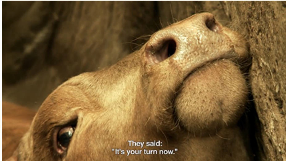
Figure 4 (6:22)