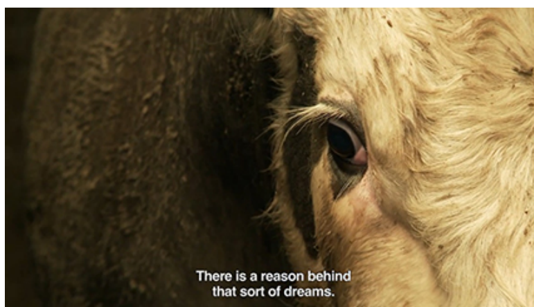
Figure 7 (06:45)