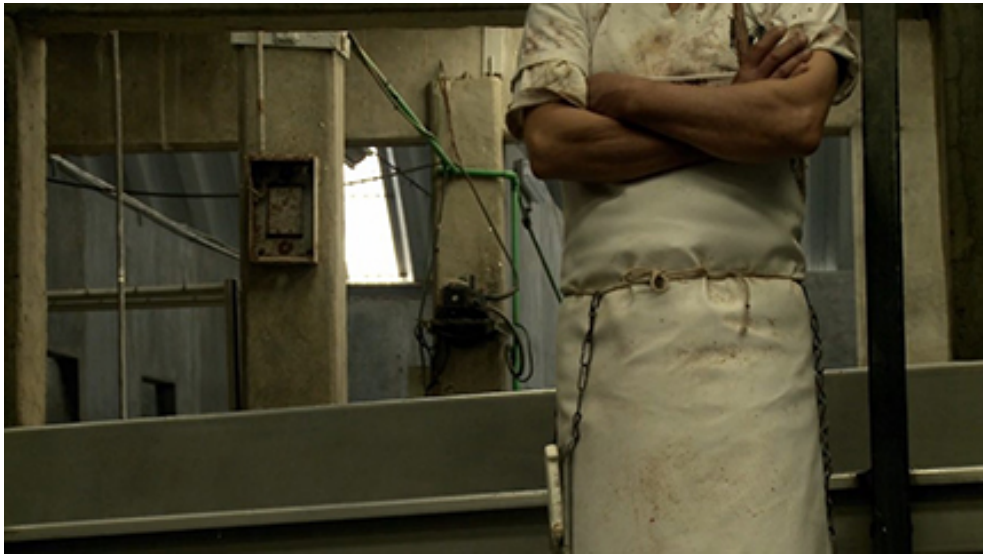
Figure 3 (04:45)

head before activating a tilting side wall that releases their spasming bodies for hanging from the overhead mechanized processing rail.