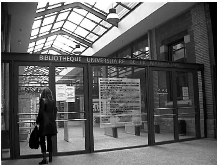
Figure 4: The entrance of the new library