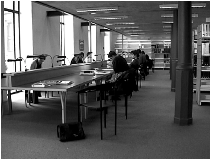
Figure 3: Reading room