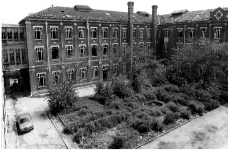
Figure 1: The tobacco factory