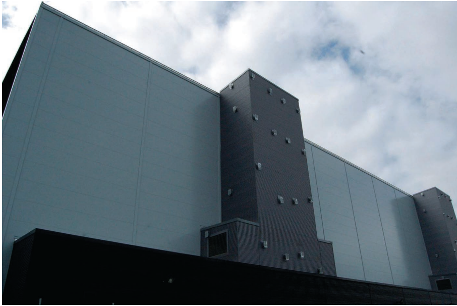
Fig. 5: External view of the Additional Storage Building.

The environmental conditions for the internal storage void will be 16^{\circ}\text{C} \pm 1^{\circ}\text{C} and 52\% \pm 5\% . This retains compliance with BS5454: 2000. This specification is designed for material for long-term retention.