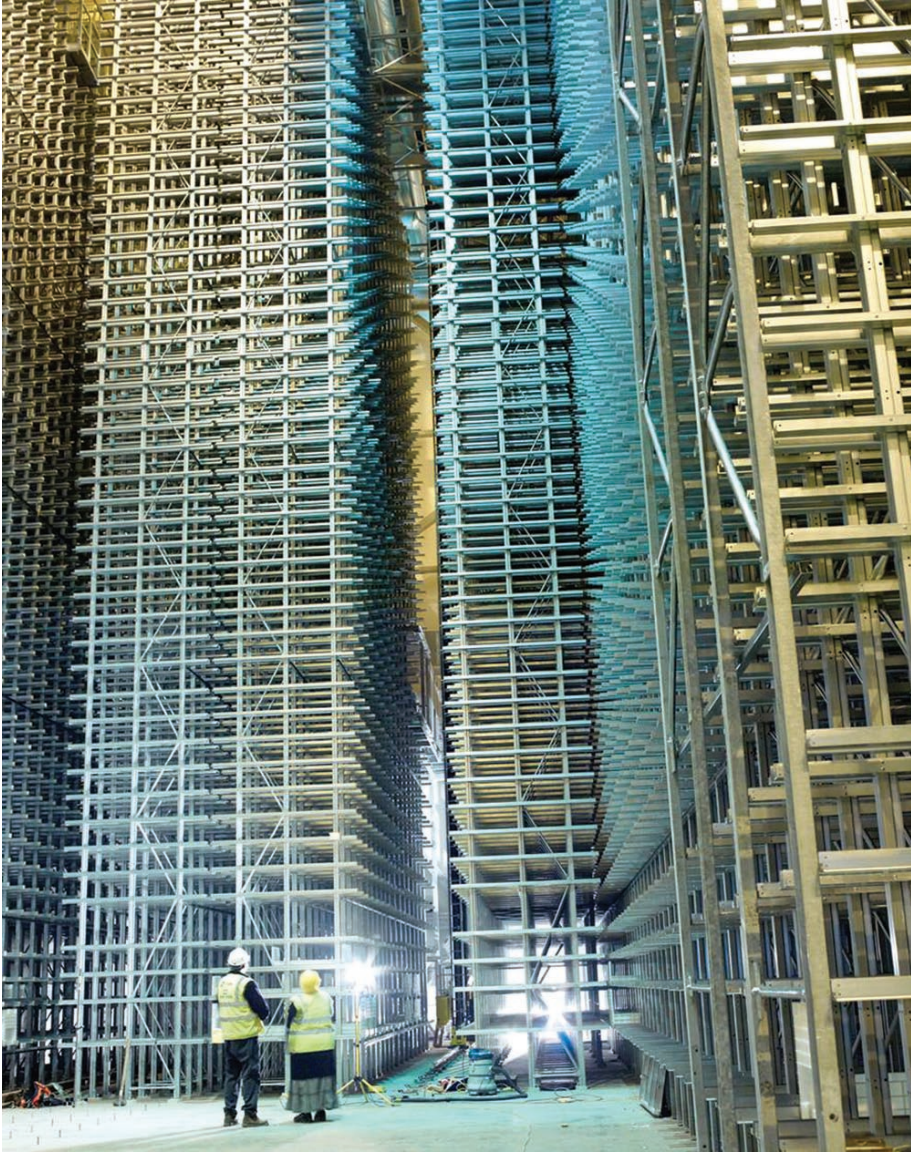
Fig. 6: Racking in the Additional Storage Building.