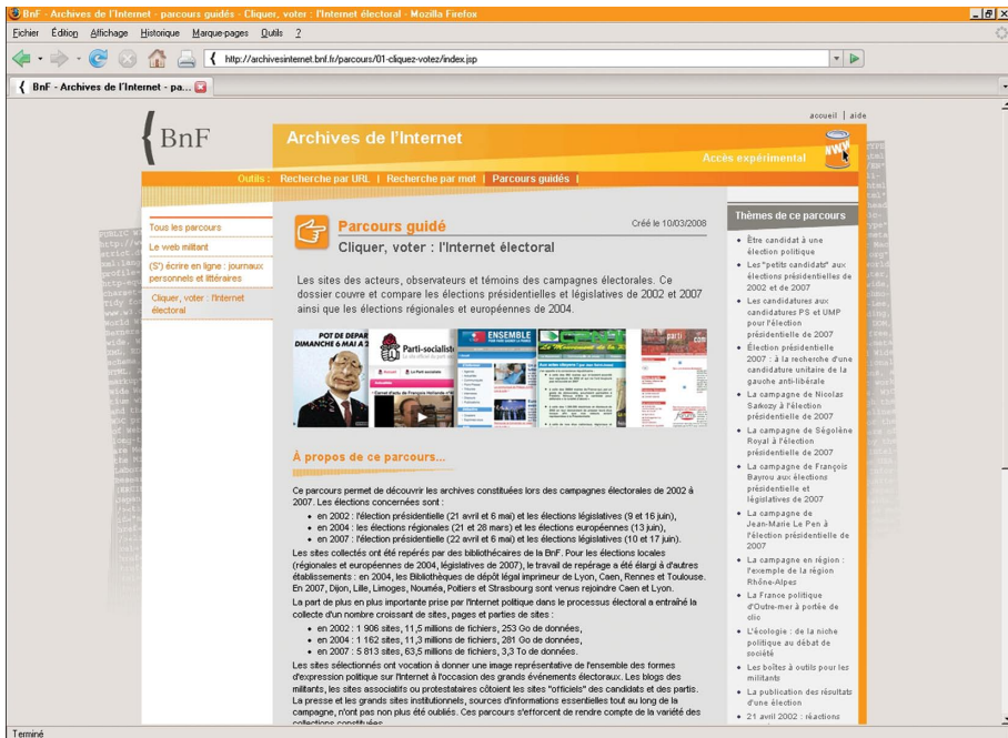
Fig. 3: 'Click and vote: the electoral Web' featured collection.