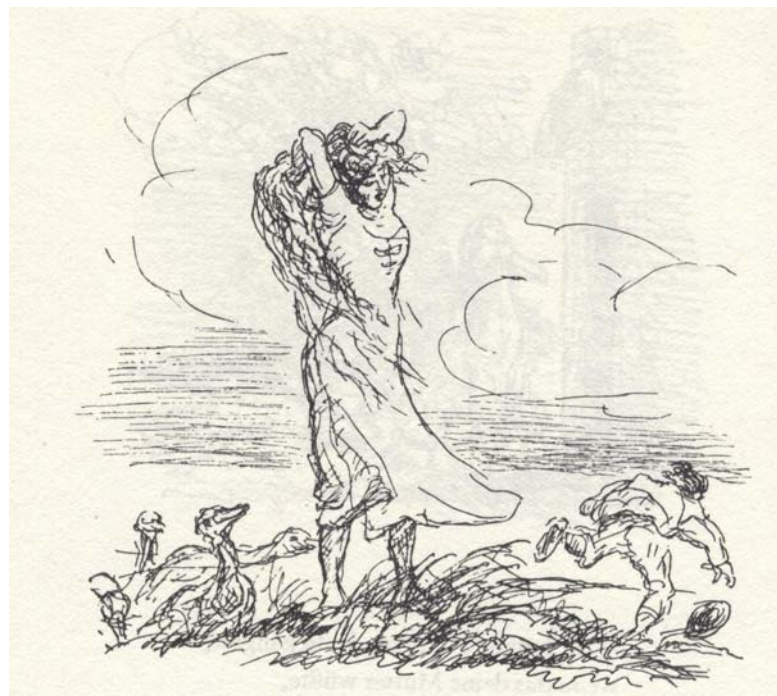
Fig. 3. Jacob and Wilhelm Grimm, Alte Märchen mit der Feder erzählt , 1920s. Reissued as Das blaue Licht und andere Märchen , Tübingen, Rainer Wunderlich, 1976. Illustration by Max Slevogt.

Max Slevogt made an addition of a different nature in his illustration of a buxom and sexually enticing goosegirl (fig. 3) (Grimm 1976, 196), who captures our attention visually. But in emphasizing her breasts Slevogt imputes a sexuality to the goosegirl for which the text offers no verbal foundation. Additions to illustrations such as Cruikshank's windblown tree, Ludwig Emil Grimm's bedside Bible, and Slevogt's sexualized goosegirl go far beyond textual content, and as such, additions like these border on reformulation. 6