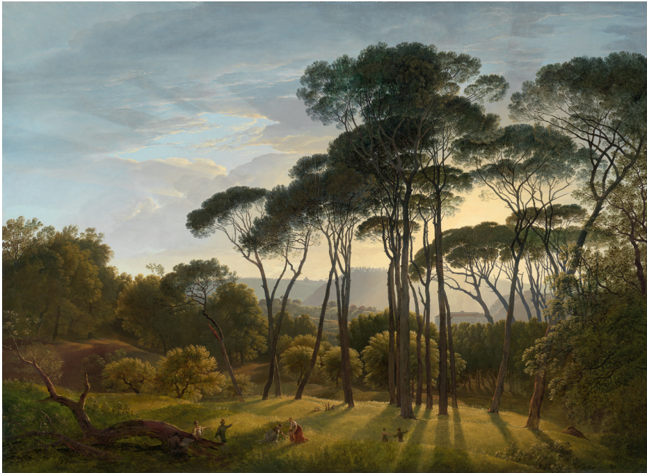
Fig. 2 HENDRIK VOOGD, Italian Landscape with Umbrella Pines , 1807. Oil on canvas, 101.5 x 138.5 cm. Amsterdam, Rijksmuseum, inv. no. SK-A-4688.