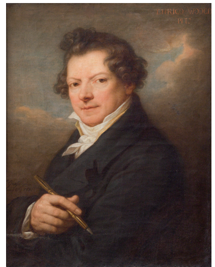
Fig. 5 GIUSEPPE GRASSI, Portrait of Hendrik Voogd , 1821. Oil on canvas, 62 x 50.3 cm. Rome, Accademia Nazionale di San Luca, inv. no. 0251.

Pencil, with brush and black ink, 210 x 158 mm. Amsterdam, Rijksmuseum, inv. no. RP-T-FM-371; on loan from the City of Amsterdam.