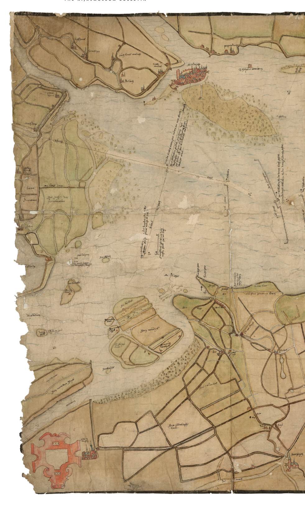
Fig. 11 Map of the Dordrecht area, a copy after a 1560 original. The Hague, National Archives, archive no. 4.VTH, inv. no. 18968.