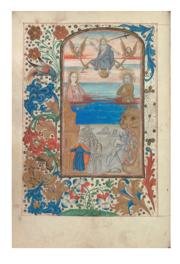
Fig. 13 MASTER OF THE DARK EYES, Last Judgement, miniature in a book of hours, Holland, c. 1490. Vellum, 200 x 138 mm. The Hague, National Library of the Netherlands, MS 76 G 16, fol. 52v.

two feet high in the streets of Dordrecht after the dikes had broken.33 Although Dordrecht was certainly affected by the flood, it is depicted in its full glory on the flood panels without any indication that the city had also suffered from the storm. Dordrecht almost seems to rise above the water. On the flood panels, Dordrecht is a haven of peace in the crowded landscape filled with people, some dead, others alive but homeless. If anything, the pictorial elements and the composition lend the scene of St Elizabeth's Flood a biblical quality that must have resonated with the viewers of the altarpiece, especially in its original religious setting.