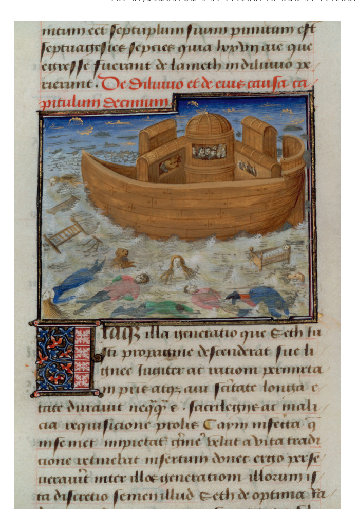
Fig. 10 MAÎTRE DE JOUVENEL and COLLABORATORS, The Deluge, miniature in Johannes de Columna, Mare historiarum ab orbe condito ad annum Christi 1250, Anjou, 1447-55 Vellum, 455 x 325 mm. Paris, Bibliothèque nationale de France, département des manuscrits, мs lat. 4915, fol. 25r.

four scenes. This master painter must have been at the head of a workshop with assistants and pupils.<sup>26</sup> Photographs of the underdrawings of the panels also revealed that the composition was not copied from a ready example. The underdrawings were made rapidly and, in both the flood and the life of Elizabeth, not all the forms were prepared. The figures in the flood scenes, for example, were added at a later stage of the production process. The master painter gave careful consideration to the composition, moving figures and adjusting details while working on the paint layers.27 The landscape of the flood panels was also changed while the