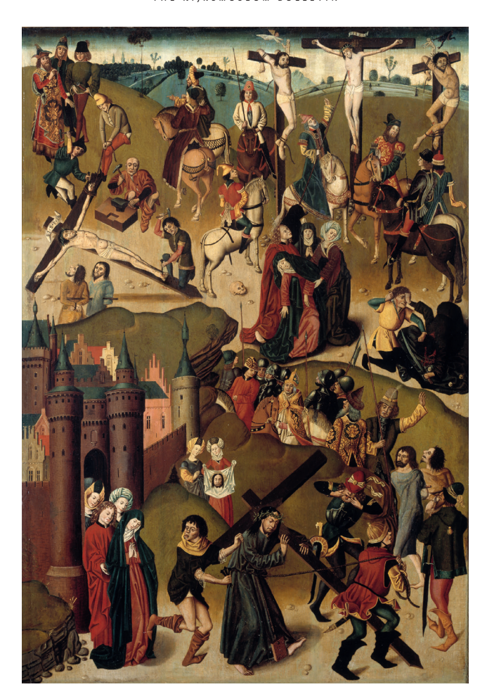
Fig. 12 ANONYMOUS (circle of ALBRECHT BOUTS), Landscape with Scenes from the Passion of Christ, Haarlem, c. 1470. Oil on panel, 132 x 102 cm. Utrecht, Museum Catharijneconvent, inv. no. ABM S126.

It seems that the painter has not depicted divine punishment that has come down on these villages, but focused on their hour of need. The movement of the figures underlines the chronology of the events, starting with the dikebreak in the right background, the flooding of the area and, finally, the refugees finding shelter in Dordrecht. The panels do not depict a single moment in history, but rather a series of interrelated events that closely follow one another, culminating in the refugees entering the city gate. In this respect, the painting is reminiscent of other models, where scenes visualising subsequent moments are placed alongside each other, inviting the viewer to follow the course of events and