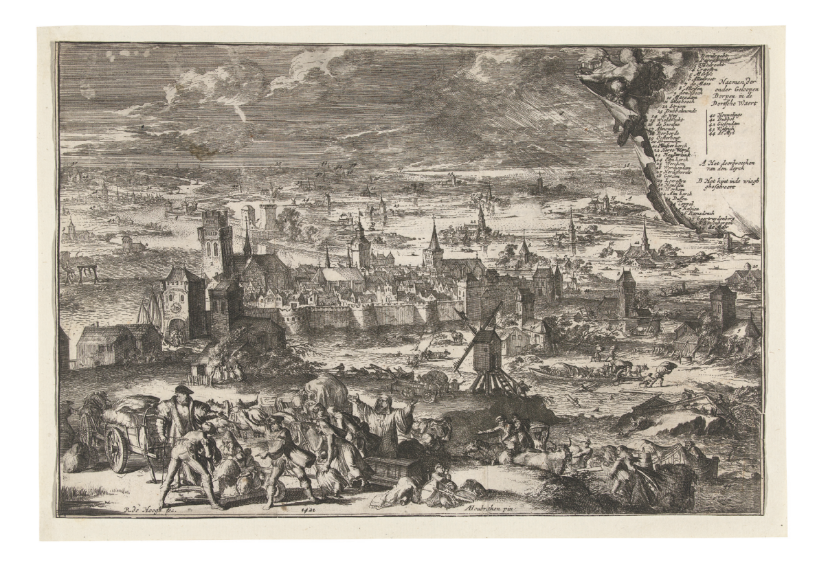
Fig. 7 ROMEYN DE HOOGHE after ARNOLD HOUBRAKEN, Flood of the Grote Waard, 1675-77. Etching and engraving, 209 x 310 mm. Amsterdam, Rijksmuseum, inv. no. RP-P-OB-76.843.

The altarpiece was removed from the church during the Reformation. The central image of the triptych did not survive, and it is uncertain what the central panel depicted, or even which technique was used to make it.14 A painting in the style of the side panels, or a sculpted image, would have been possible and plausible. The wings were saved when they were transported to the Schuttersdoelen, the training ground of the militia quartered in the Steegoversloot in Dordrecht. When the Schuttersdoelen moved to the former Augustine monastery, the panels were placed in the room that had been the refectory. After 1801, but before