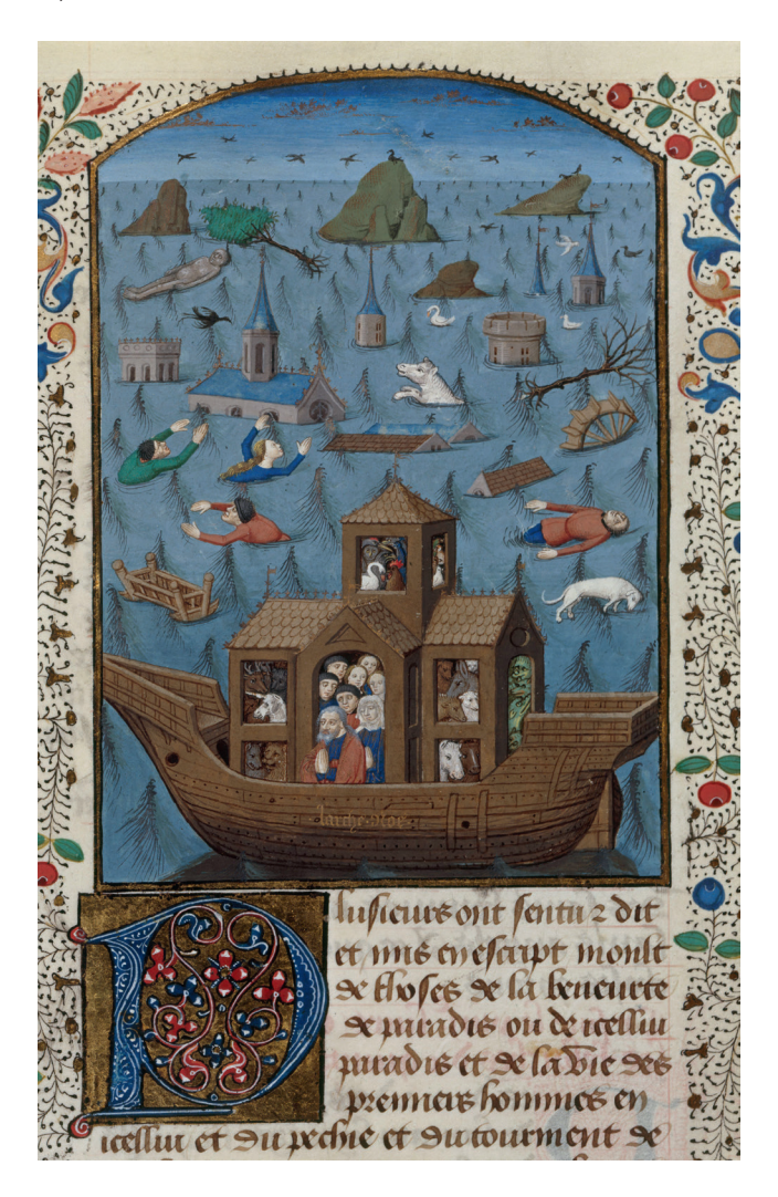
Fig. 8 MAÎTRE DE L'ÉCHEVINAGE, The Deluge, miniature in Raoul de Presles's translation of Augustin's La Cité de Dieu, Rouen, third quarter of the fifteenth century. Vellum, 460 x 345 mm. Paris, Bibliothèque nationale de France, département des manuscrits, мs fr. 28, fol. 66v.

Dieric Bouts depicting the surroundings of Haarlem. Bouts probably painted it before he moved to Leuven where he is mentioned for the first time in 1457. He combined the life of a saint with a geographically defined landscape on an altarpiece foreshadowing the St Elizabeth triptych in Dordrecht in many respects.