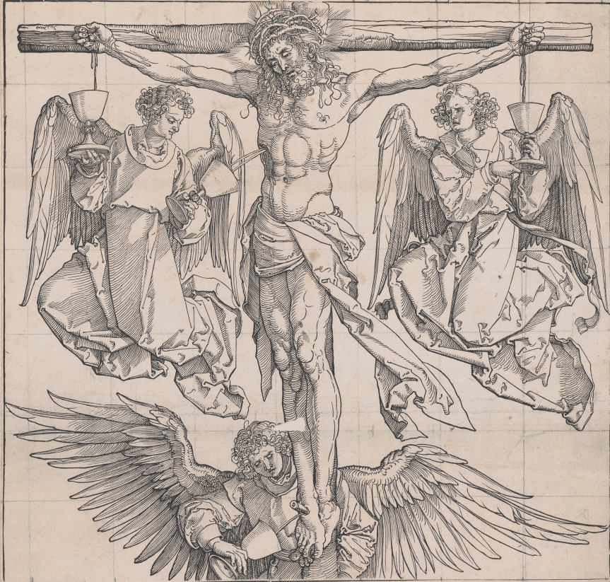
Compassio et contemplatio mortis christi.