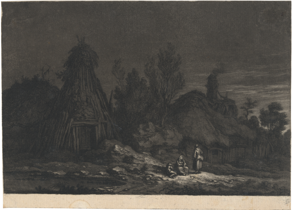
RP-P-2018-3316 (fourth state)