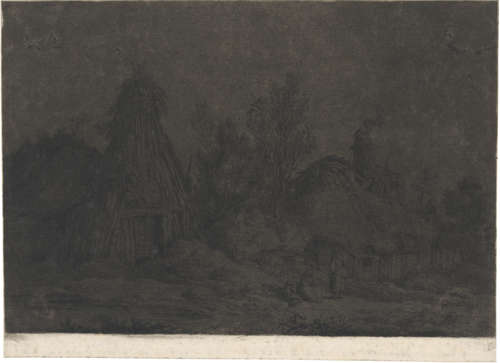
RP-P-2018-3313 (first state)