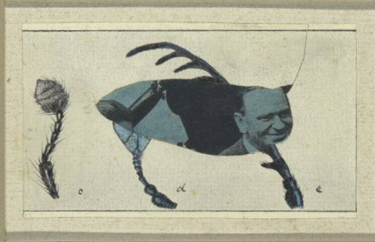
Blauwe Mealkever ( G. vernalis )