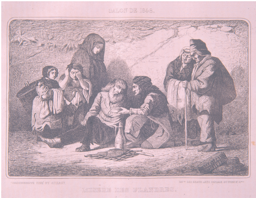
Illustration 2 'Misère des Flandres' – Poverty in Flanders (source: Etching by Vandekerkhove, Collection Central Library KU Leuven, CAG 00001861, also on: www.hetvirtueleland.be , Centrum Agrarische Geschiedenis (CAG)).

early on. Moreover, by means of selective distributional policies, local elites directed their support to small groups of inhabitants.