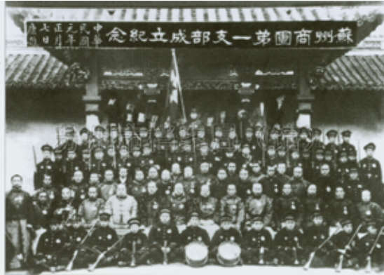
Illustration 2 Suzhou Merchant Corps, photograph in commemoration of its reorganization on 26 March 1922. (source: Website of the Suzhoushi difangzhi bianzuan weiyuanhui bangongshi Suzhou City Gazetteer Compilation Office), Foto Gallery, installed on 19 December 2008. http://dfzb.suzhou.gov.cn/dfzb/mgq/200812/6e7ff1aa5d-de42f9bea0cf045f68616b.shtml [Access 7 September 2020].

they were established in the wake of the revolution, such as in Shanghai and Guangzhou (Canton). 13 With memberships in the thousands in the cities and in some cases subbranches in smaller towns, they constituted a force that urban administrations had to reckon with and often first tried to impede, then to co-opt. One spectacular case from the Warlord era is that of the Guangzhou (Canton) merchant militia that resisted the military government under Sun Yatsen in 1924 during the so-called Canton Merchant Corps Uprising. 14 The function of these voluntary corps was the protection of merchant property, but also the maintenance of public order in periods of declining capacities of the urban police forces. The organizations were often short-lived. The corps that lasted longest was the Suzhou Merchant Corps: from the foundation of the physical exercise club in 1906 until the dissolution in 1936 by order of the Nationalist government. These were the times when in Europe almost all countries formed nation states and had more or less centralized governments.